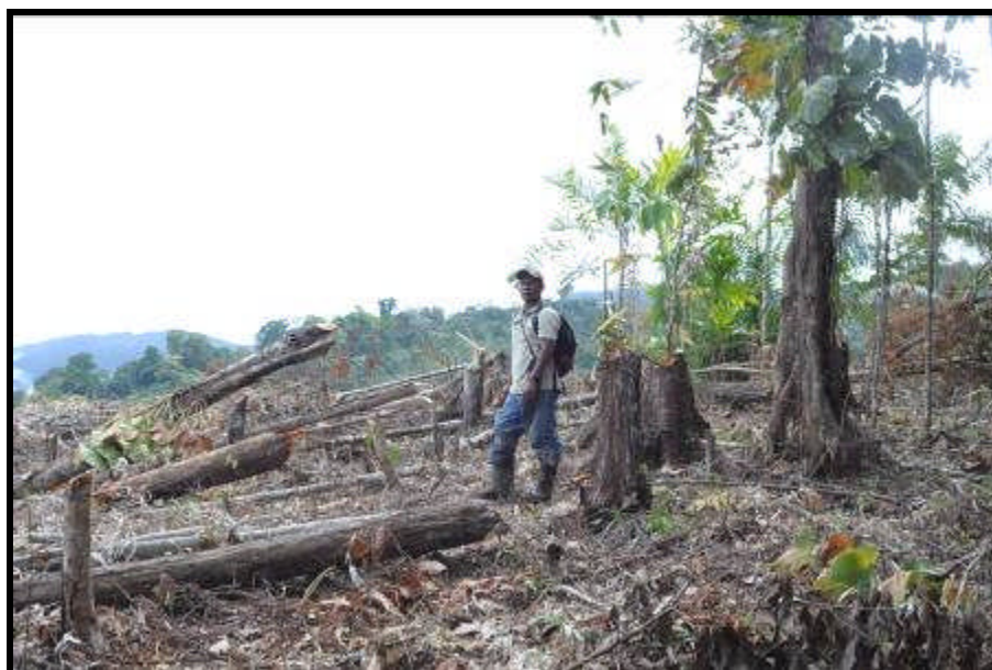
Fig. 3. Evidence of illegal logging in the Park’s buffer zone encountered during one of two field visits in February 2011.

In addition ground-truthing for Phase 2 the two field visits in February confirmed and identified illegal logging within the buffer zone of PILA (see Fig. 3). In addition the field visits enabled claims of illegal mineral exploration within PILA made by the indigenous communities of Alta Talamasca, to be verified. The team identified three clandestine in the Alto Urén sector of the park, within the buffer zone. It would appear that these are used for the shifting of heavy mining equipment into the core of PILA associated with the extraction of gold. One of these helipads was also inspected by ADITIBRI and representatives from Costa Rica’s Ministry of Public Security (Ministerio de Seguridad Pública). ADITIBRI has reported the findings of these field visits to SINAC.